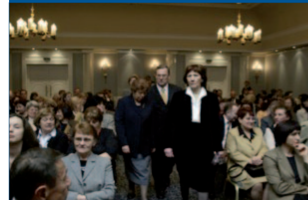
Celebration of the 50th anniversary of the CSMBLM was organized under the auspices of the Croatian parliament and attended by the President of parliament, Dr. Zlatko Tomčić (Zagreb, 23rd of April 2003)